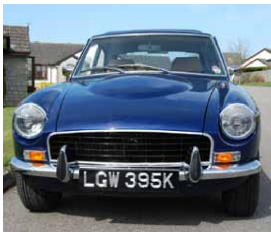
Pure Costello – bonnet bulge and non-standard grille.

myself restored Vauxhall DXs in my younger years, I wanted the car to be correct and am happy that it is now in as near concours condition as possible. I won't be chasing any trophies as I have done in previous