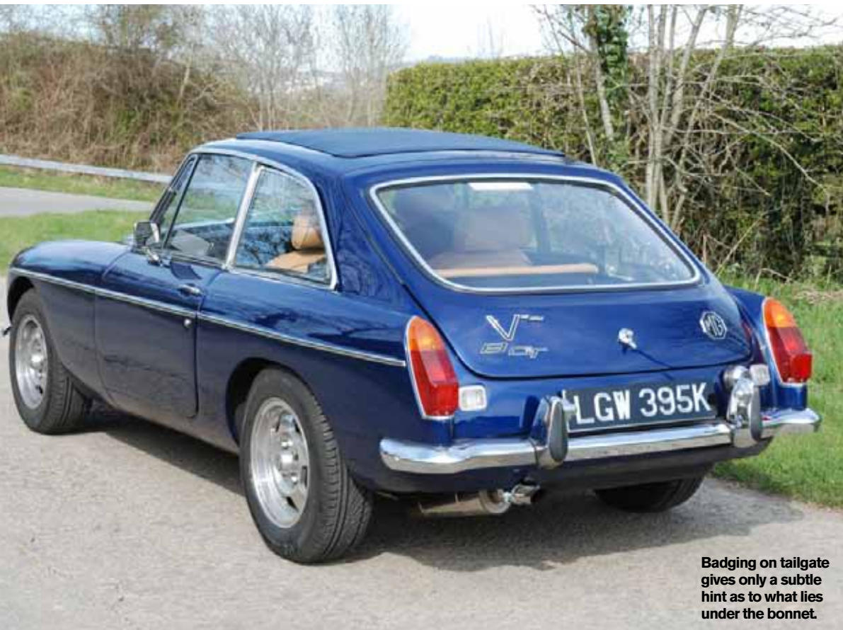
Badging on tailgate gives only a subtle hint as to what lies under the bonnet.

years with my pre-war Vauxhalls, though. My daughter still calls it 'her' car, but I'll be the one racking up the miles. And it has to be said, I will be racking them up rather more quickly than I do in my Vauxhalls!