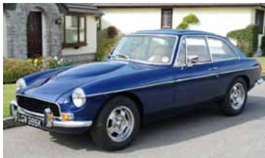
Brian's car rides on a set of refurbished Wolfrace wheels.